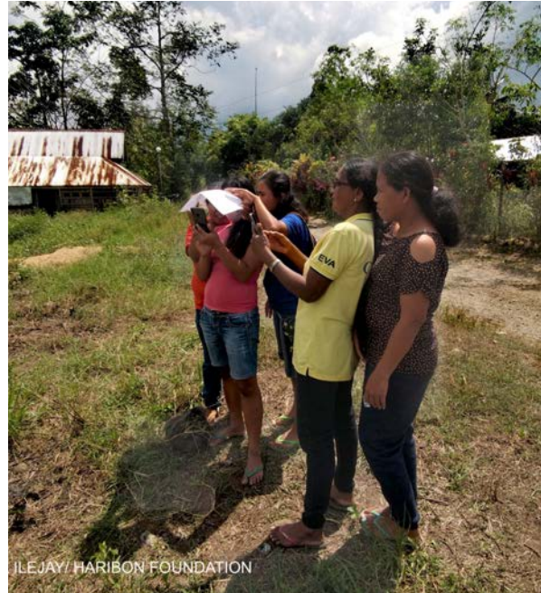
Image: Haribon Foundation - Women Bantay Gubat in Sablayan Occidental Mindoro using CAME tool

In 2018, prospective bantay gubat members from three priority KBAs i.e., Mounts Irid-Angilo and Binuang, Mount Siburan and Mount Hilong-hilong, were identified and underwent a capacity building program through the Strengthening Non-state Actor Involvement in Forest Governance Project implemented by BirdLife International, jointly with the Centre for International Development and Training (CIDT) and funded by the European Union.