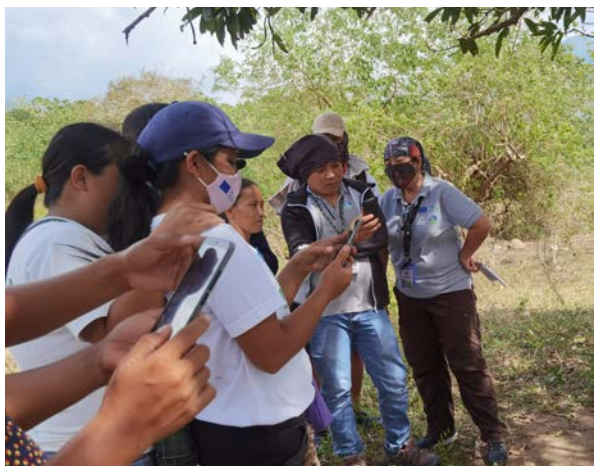
Bantay Gubat receiving a tutorial on the KaPatrol App.

"CAME is designed to complement the existing biodiversity monitoring tools employed by the government and highlight the important role of civil society organizations in forest monitoring and reporting."